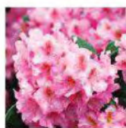
'Scintillation' Flower: Funnel-shaped blooms of clear pink with yellowish-green throat and wavy edges; large, ball-shaped truss. Height after ten years: four feet. Habit: Broad. Leaves: Glossy, oblong with rounded base. Hardy to -15°F.