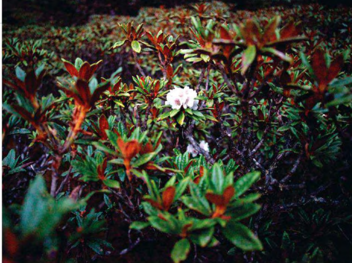
Bloom time in Bhutan (above); a towering ‘Loderi King George’ (right) at the Leonardslee Gardens in West Sussex, England.

largest collection of rhododendrons. The Rhododendron Species Foundation Botanical Garden, which covers 22 acres in a conifer forest just south of Seattle, boasts more than 600 of the 1,000-plus identified species. All major subspecies of the genus are represented, starting with the most common, the elepidotes (meaning leaves without scales). These plants typically feature large foliage that is sometimes covered with fuzzy, feltlike indumentum, and iridescent flowers that tend