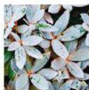
'Cinnamon Bear' Flower: White bell-shaped blooms, about 20 per truss. Height after ten years: two feet. Habit: Compact. Leaves: New growth has white cast; at maturity, a heavy cinnamon-brown indumentum. Hardy to 0°F.