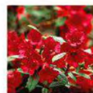
R. forrestii Flower: Single or paired bell-shaped crimson blooms. Height after ten years: one foot. Habit: Creeping dwarf shrub. Leaves: orblike, with wrinkled upper surface that turns purple closer to the ground. Hardy to 0°F.