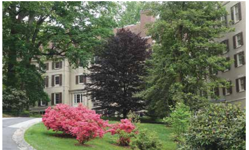
Winterthur, Winterthur, DE.