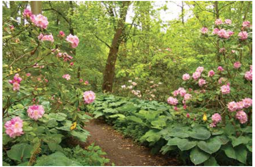
Scott Arboretum, Swarthmore College, Swarthmore, PA: