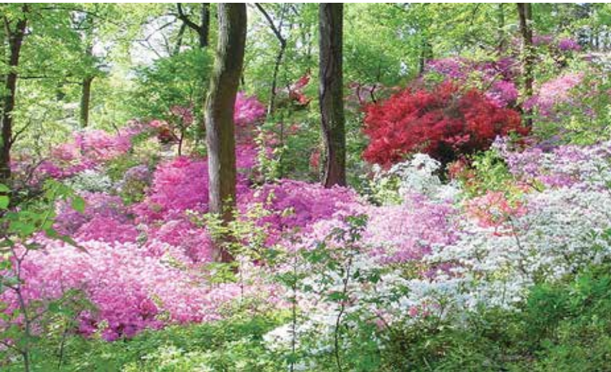
Morris Arboretum, Chestnut Hill, Philadelphia, PA:

The site of an ARS Test Garden in the 1950s and home to many Dexter hybrid rhododendrons, this grand estate-turned public garden also has an azalea meadow with descendants of many of Henry Skinner's wild collected native azaleas.