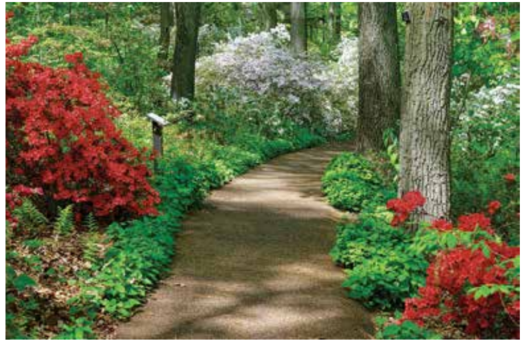
Jenkins Arboretum, Devon, PA