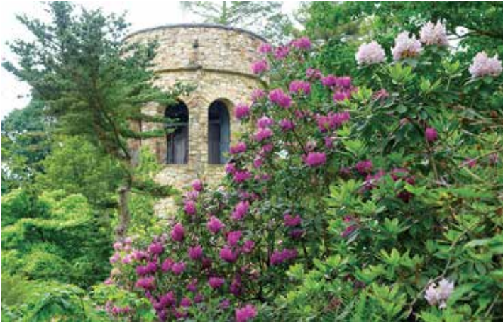
Longwood Gardens, Kennett Square, PA:

As the region transitioned to a more democratic expression of horticulture, organizations like the Pennsylvania Horticultural Society (PHS) took up the cause of gardening as a means to address social issues including urban blight and food insecurity resulting from a rapidly urbanizing city. Founded in 1827 and the creator of the oldest and largest flower show in the world, the PHS transitioned from a cloistered private society to a community development organization responsible for many of the public landscapes, tree planting initiatives, and community gardens that are part of the fabric of Philadelphia today.