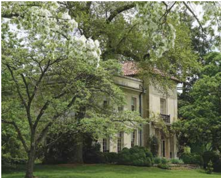
The Barnes Arboretum, Merion, PA.

The DuPont family of Wilmington, Delaware, pursued gardening on a scale almost unparalleled anywhere in the country. With their vast gunpowder and chemical fortune, this large, extended family lived on nearly contiguous properties, and invested in sophisticated and elaborate gardens, often with a French influence inspired by their ancestors. Pierre DuPont acquired his estate "Longwood" from the Pierce family, Quakers who had built a small arboretum on 15 acres (six ha) of their farm, providing the foundation for one of the most extensive living plant collections in the country today.