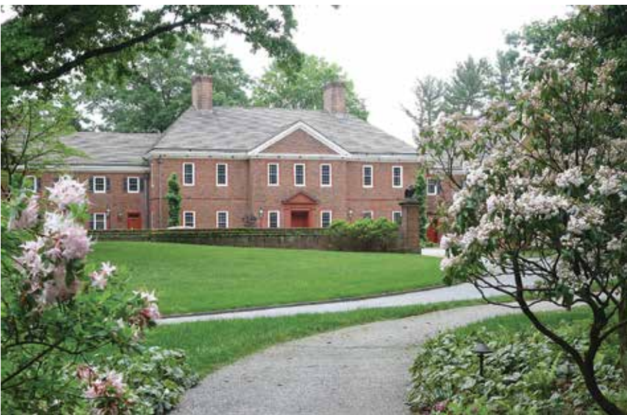
Mt. Cuba Center, Hockessin, DE.