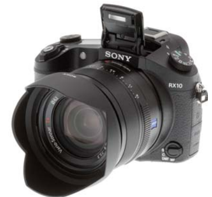
Sony RX10 Superzoom

Camera: I take a camera with a rechargeable battery and spare batteries. Many people just use the camera on their cell phone. My camera is a digital "super-zoom" meaning it has a zoom lens that goes from wide angle to long telephoto. It also is very sensitive and can take pictures in most lighting conditions without flash. It has a flash to use for filling in harsh shadows when photographing in direct sunlight. It has over four-times as many pixels as I really need, but they are useful for extra resolution when