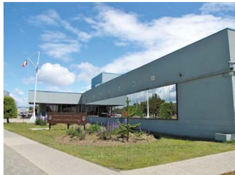
Naval Hospital in Punta Arenas, Chile

Second, trip coverage often covers losses of baggage and trip cancellation by either you or the tour company. It usually covers trip interruption by illness or injury, terrorist threats, or emergency travel home. We had a 4-week trip to Africa interrupted by a death in the family while we were in Amsterdam, en