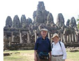
Angkor Watt, Cambod.