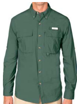
SPF quick-dry no-iron long-sleeve shirt

Sports Coat: Since packing a sports jacket takes up lots of space, I found a Sports Coat with no shoulder pads that packs compactly with my shirts and doesn't wrinkle.