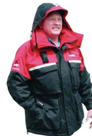
Uninsulated Rain Parka

Rain Parka: We always take uninsulated rain parkas, with both a zipper and snaps, that rolls up to a compact size. The zipper is good in cold weather. The snaps are for warmer weather or if the zipper fails and the help insulate over the zipper in cold weather. I keep gloves in the pocket of the parka.