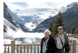
Lake Louise, Canada