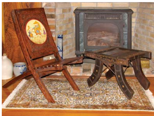
Folding Chair, Camel Saddle & Silk Carpet purchased in India and shipped home.

When I was in India, I found 3 larger items, a folding chair, a camel saddle, and a silk carpet. Since I was with a reputable tour and the tour guide worked with me to arrange home shipment, I went ahead and got them. They arrived in excellent condition. The folding chair and camel saddle were packed in hand made aluminum trunks. You can't always trust merchants unless they can be held accountable.