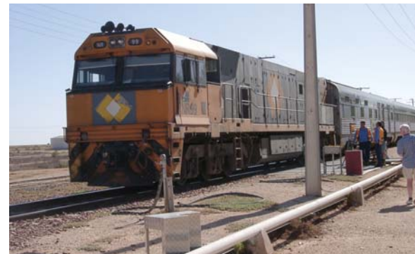
Indian Pacific crosses Australia's outback.

Train: Train travel is very common outside the US. It is very relaxing and has more opportunities to take photographs than you get on a bus tour. You can even go to a platform between cars and take photos with no windows in the way. Most train trips don't stop very often to visit attractions.