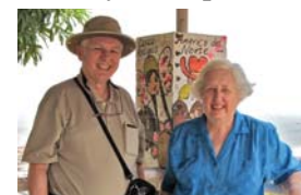
Panama City, Panama