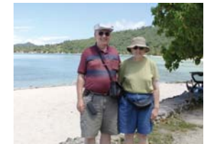
Bora Bora, Polynesia