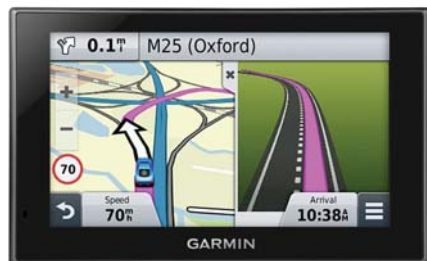
Garmin Nuvi 2577LT with Maps of North America and Europe

Maps: When traveling by car, road maps are important, even if you have a GPS. We have a store in King of Prussia, PA, called Franklin Maps that has road maps of just about every place in the world. Even if we are not driving we like maps of the area so we can follow along while we are traveling. When exploring a city it is important to have a city map. AAA carries some inexpensive popup maps of major cities. The maps in tourist brochures in hotel lobbies are good also.