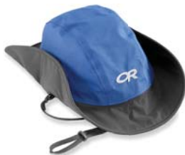
Outdoor Research's Seattle Sombbrero