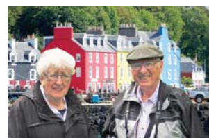
Isle of Mull, Scotland