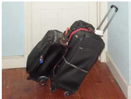
My 26" suitcase & small carry-on bag strapped together with a dog collar

We love to travel and don't like lugging heavy suitcases around, especially as we get older. Whether traveling for a weekend or 10 weeks consecutively, we usually pack fairly much the same things. We usually have enough clothing for 6 days . On long trips we plan on doing laundry