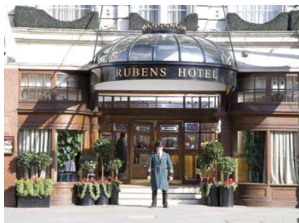
Rubens at the Palace is one of London’s finest boutique hotels

Hotels: It is always easiest to stay in large “American style” hotels such as Hiltons, etc. But our most memorable experiences are when we stay at smaller boutique hotels. We always check in guide books for a highly recommended local hotel. We get much more personal service and learn more about local customs. Usually someone at the front desk can speak English and help us plan our daily itinerary. They will even write out our itinerary so that a taxi driver knows where to take us and how to bring us back to our hotel.