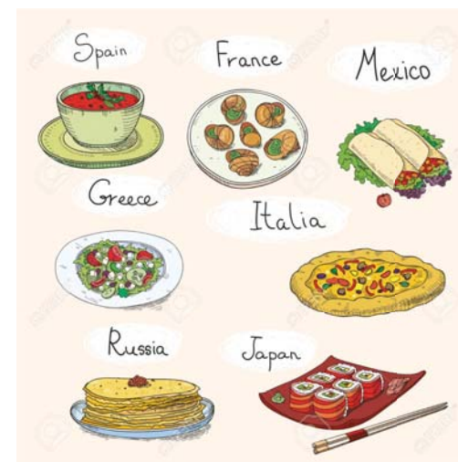
Travelers taste the world's best foods

Food: Some people have trouble adapting to food or water in different areas. Always drink bottled water unless you are sure of the local tap water. Even some tap water in the US is not potable. Some potable tap water may cause unpleasant symptoms if your system can't adapt to differences. When in doubt, only eat foods that are cooked or peeled. One sage saying