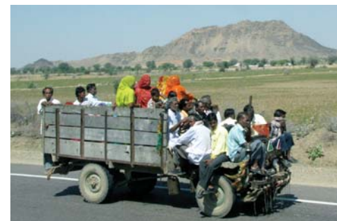
Budget group travel on a jugaad in India

Escorted or Group travel: Escorted travel means that you will have a tour director that goes with you and a local guide in places where you stop. Sometimes with a smaller group there is only a tour guide. Group travel usually involves buses and can also involve cruise ships, river boats, and/or