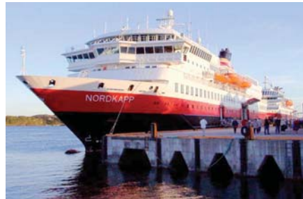
Norway's Hertigruten "Nordkapp"

Another of our favorite trips was a partially independent and partially group trip on ships. It was an a la carte package on the Hertigruten , the Norwegian Coastal Mail Boat. It is actually a system of 13 ocean going ferries of varying sizes that carry up to 1,000 passengers and have up to 300 optional cabins. It is a 7-day cruise northbound or 6-day cruise southbound along the coast of Norway with stops at 34 cities between Bergen in the south and Kirkenes in the north on the Norway-Russia Border on the Barents Sea. They offer excursions during the extended stops at larger cities. You can stay over at any stop if you can find lodging and catch another ship on a subsequent day. The ships have comfortable accommodations and good meals, but are not resorts like cruise ships.