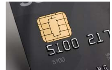
The chip in a Chip Card

Cards: If traveling anywhere outside the US, we only take cards with chips . Most other countries only accept cards with chips. When choosing which credit cards and debit cards, we choose ones with the lowest foreign transaction fee . Always read the fine print and see what the fees are. At airports we need our credit cards or passports to get our boarding passes.