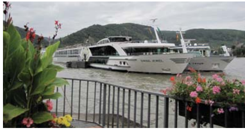
2 Tauck River Boats on the Rhine River

River Boats: River boats are a great way to travel. They usually carry between 60 and 130 passengers. They have the most stops. Not only are there shore