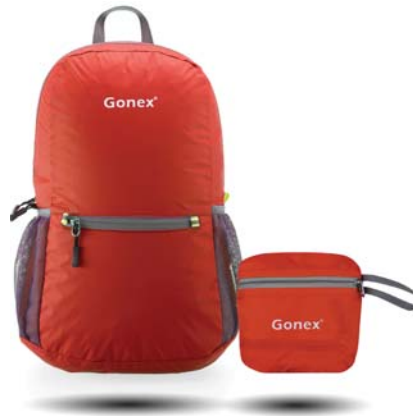
Ultra lite Day Pack that folds into a pocket.

Internet: We take a device for Wi-Fi email and browsing. This is our preferred way of communicating with people back home, and it works well no matter what time zone we are in. We must always remember that Wi-Fi is not as prevalent abroad as it is back home. You can almost always count on the lobbies of better hotels for free Wi-Fi. Other than that, you have to be flexible and wait until you find Wi-Fi access. I prefer an iPad. For people that text while traveling in different time zones, they must be aware that the person that they are emailing may be sleeping.