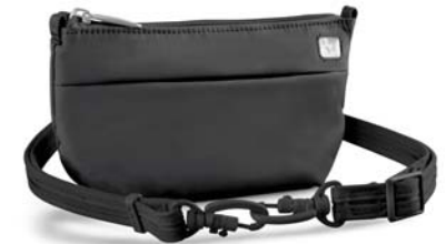
Pacsafe Anti-Theft Fanny Pack

Be Prepared: We always check the State Department's website for travel advisories . This is even important when traveling back to a place where we feel comfortable. Things may have changed. In most destinations, the biggest threat is pick pockets. Men should carry their wallets in a front pocket with a rubber band around it so it won't easily slide out of their pocket. Women are advised to use " fanny packs " rather than purses. These "fanny packs" are small and are worn with the pack in front. Even with my wallet in my front pocket and a camera bag hanging over the pocket, I was pickpocketed. Thankfully, I had a spare wallet in my suitcase with a different set of credit and debit cards and photocopies of my IDs. We cancelled the lost cards and were able to finish our trip. My passport was in a different pocket and was safe.