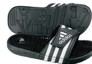
Lightweight Shower Shoes

Most luxury hotels have common toiletries and tissues in case you forget something. However, many countries don't have the products you are accustomed to, so be sure to take ample amounts. I always make sure my deodorant is new, by taking the used one from my travel bag when I need a replacement at home, and putting the new one in my travel bag. I carry a couple small, travel sized toothpaste tubes and a spare comb. For a safer shower I always have lightweight cloth-free shower shoes that are easy to dry. We take small travel sizes of any bulky items. We always take tissues with us in case we must use a toilet with no paper. We also take extra tissues in our suitcase and replenish as we can. We keep our toiletries together in a pouch.