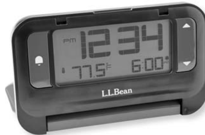
LL Bean Widescreen Travel Alarm

Chargers: Make sure all chargers are for 110-220v, 50/60 Hz. This avoids the hassle of having voltage converters, which are heavy transformers. I always take an extension cord. It means that I only need one plug adapter and permits me to plug multiple chargers in at one time. It also solves the problem when the outlet is not where you want to place your chargers.