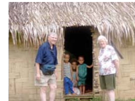
Mountain Village, Fiji