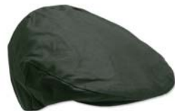
Waxed Cotton Flat Cap folds small enough to carry in your pocket