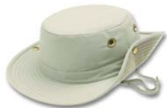
Tilley Hat from Canada is guaranteed for life