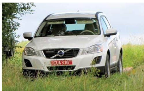
Our European Delivery Volvo in Sweden

Car: One of the best ways to travel usually is by personal car or rental car. Driving is relatively easy in countries that have the same alphabet that we do. It is even easier with a GPS. Many European car makers have a European Delivery program where you buy the car before you leave home, and pick it up in Europe, drive it, and then the car maker ships the car home. You usually save quite a bit on the car, and get the use of it in Europe. We have done this 7 times with Volvo and highly recommend the program.