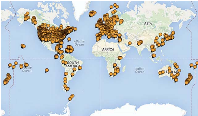
Map showing places we have visited in all US states and Canadian provinces and in over 90 countries on all continents