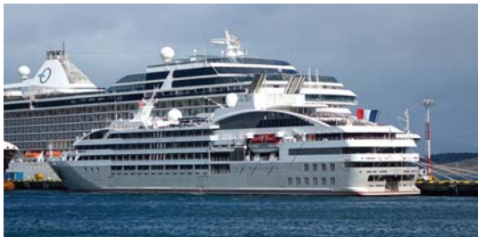
Small Ship Le Soleal en route to Antarctica & Cruise Ship Marina en route to Polynesia

Small Ships: Small ships are also a great way to travel. They quite often only have 40 to 250 passengers, not thousands. The accommodations are very nice, though the evening entertainer may be the person who serves you meals or cleans your