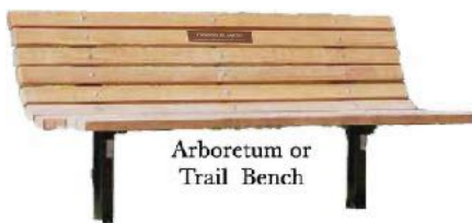
Arboretum or Trail Bench