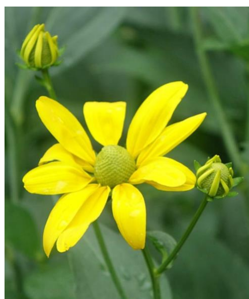
Yellow Coneflowers are opening