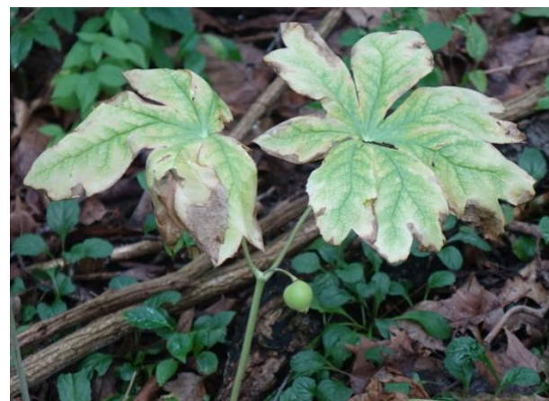
The Mayapples are Fading