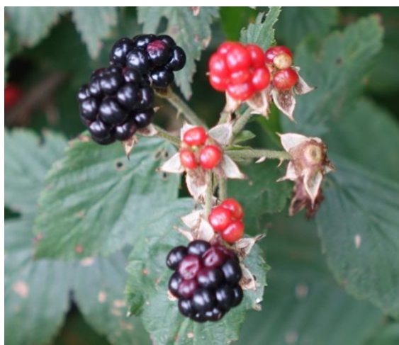
Black Raspberries are getting ripe