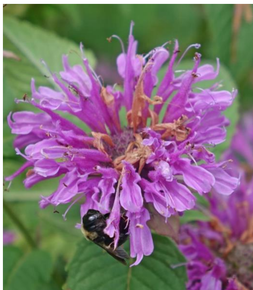
Bee Balm is attracting pollinators