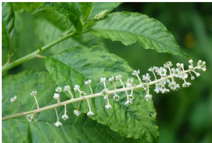
Poke Weed is beginning to bloom