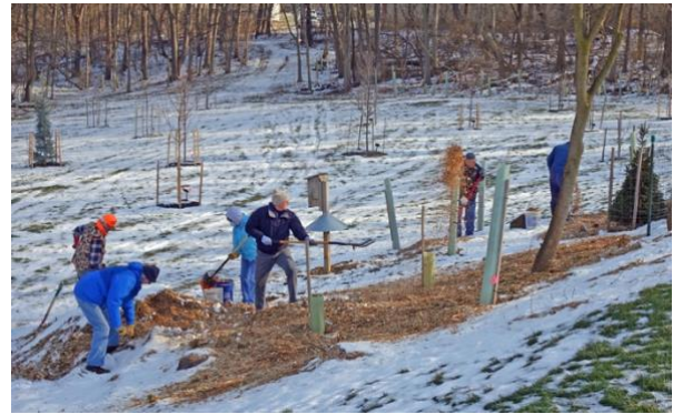
Spreading wood chips to mulch flower bed.