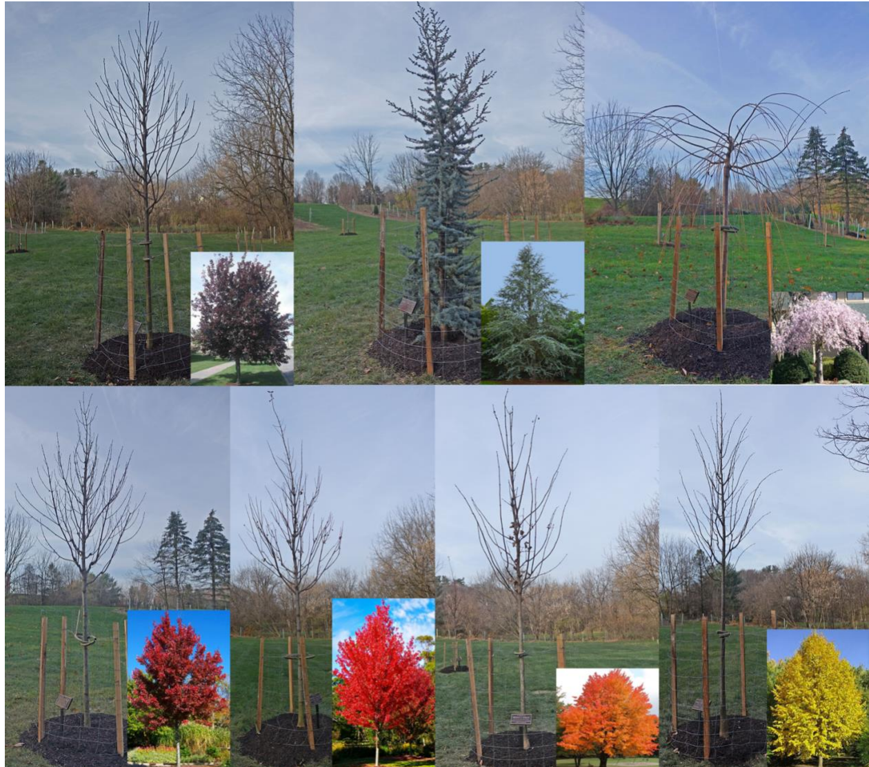
Trees as planted in Nov. & eventually when mature. Top, left to right: 'Schubert' Canada Red Cherry, Blue Atlas Cedar, 'Double Pink' Weeping Cherry. Lower, left to right: 'Sun Valley' Red Maple, 'October Glory' Red Maple, 'Green Mountain' Sugar Maple, and 'Greenspire' Littleleaf Linden.