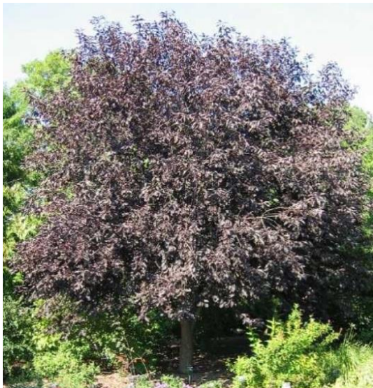
Canada Red Cherry, Prunus virginiana 'Schubert'