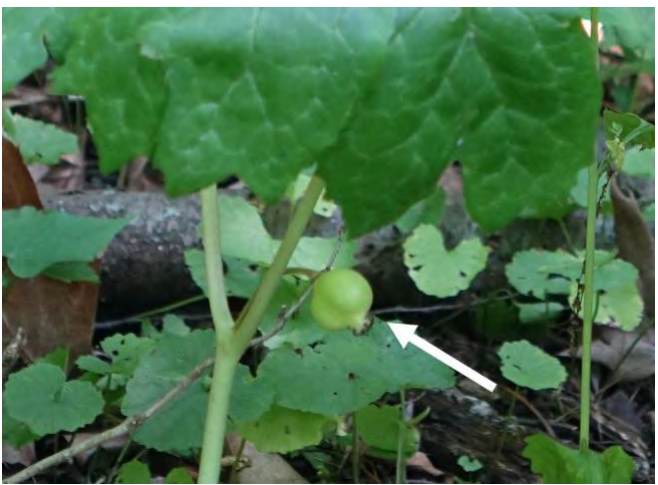
Mayapples that were pollinated by bumble bees are beginning to produce their single "apple."