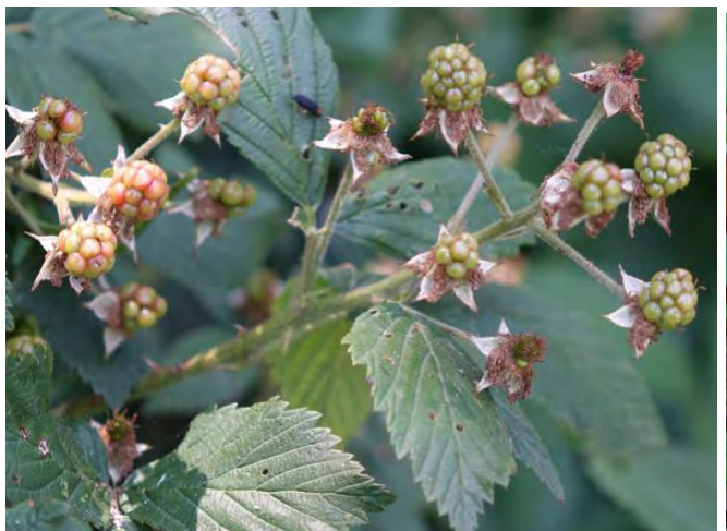
The Black Raspberries at the Romarin entrance to the Nature Trail are starting to produce berries.