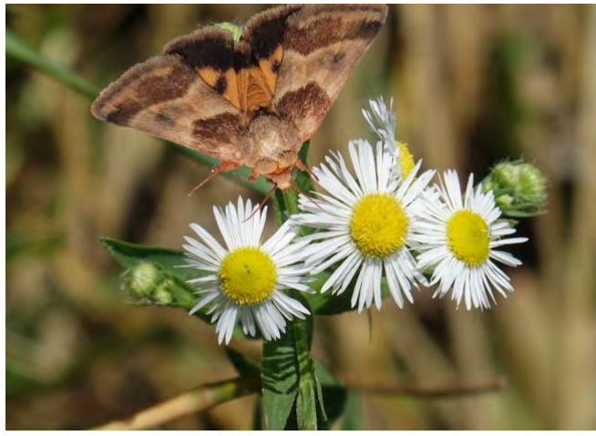
Fleabane Daisy, a small wild flower, is blooming along the trail, hosts Lynx Flower Moth (shown).