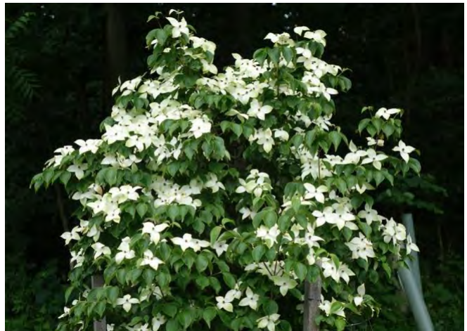
The Kousa Dogwoods in the Arboretum and on campus were covered in flowers in June.