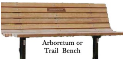
Arboretum or Trail Bench