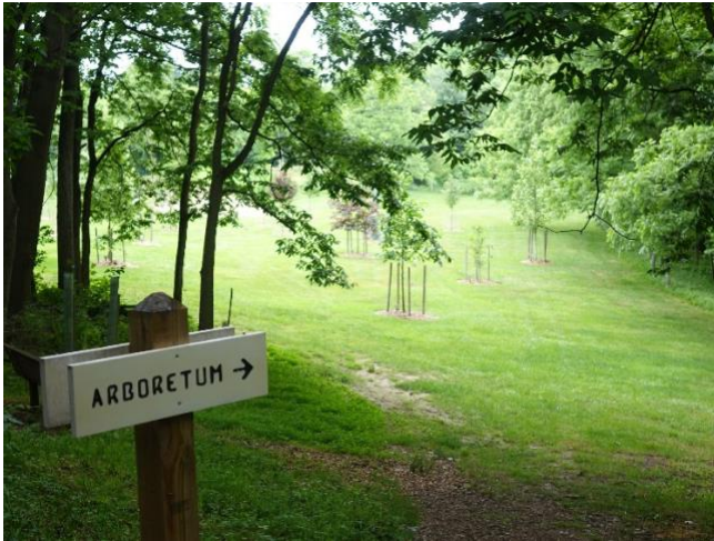
Honor/Memory Tree Arboretum, shown above, is now one part of the WCV Campus Arboretum.