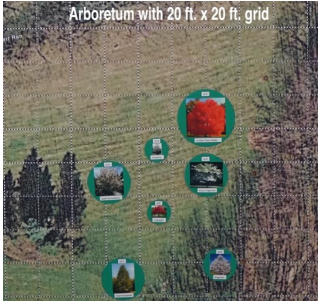
Preliminary Arboretum Plan

Our first two Honor/Memorial Trees were planted last November. Tree of Life Services, who plants the trees recommends planting the four new trees after they go dormant in late October or Early November. Hence, we hope to have a Dedication Service for all 6 trees in November. We will announce a date so that loved ones can be invited to attend. Of course, all Covid-19 precautions will be in place.