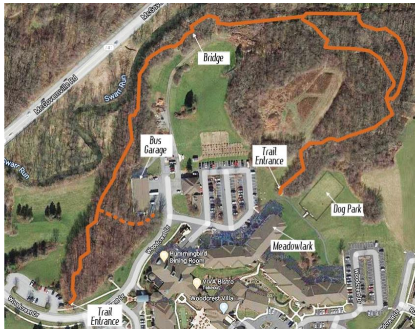
Map showing Woodcrest Villa Nature Trail

For more information on the Nature Trail contact Jerry Lawrence at 717-984-2760 or grlawrence@comcast.net